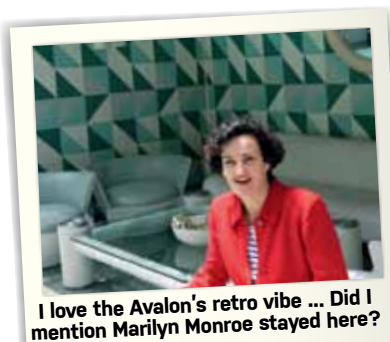
I love the Avalon's retro vibe ... Did I mention Marilyn Monroe stayed here?

Rodeo Drive. With its kidney-shaped pool, vast rooms, quirky vintage décor, free valet parking and WiFi, I could not have been happier. Marilyn Monroe actually stayed here, which gave me an extra swagger in my stride. (The polenta cake at Oliverio's in-house restaurant helped too!)