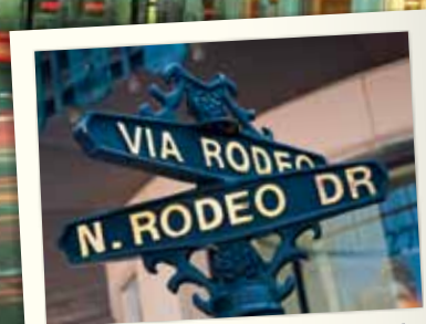
In Beverly Hills, it's obvious all roads lead to those designer shops!